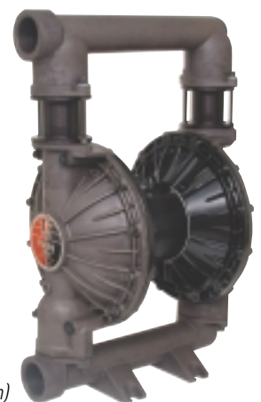
2 inch (50.8 mm) Husky 2150 Extended

All written and visual data contained in this document are based on the latest product information available at the time of publication. Graco reserves the right to make changes at any time without notice. Graco Inc. is registered to I.S. EN ISO 9001.