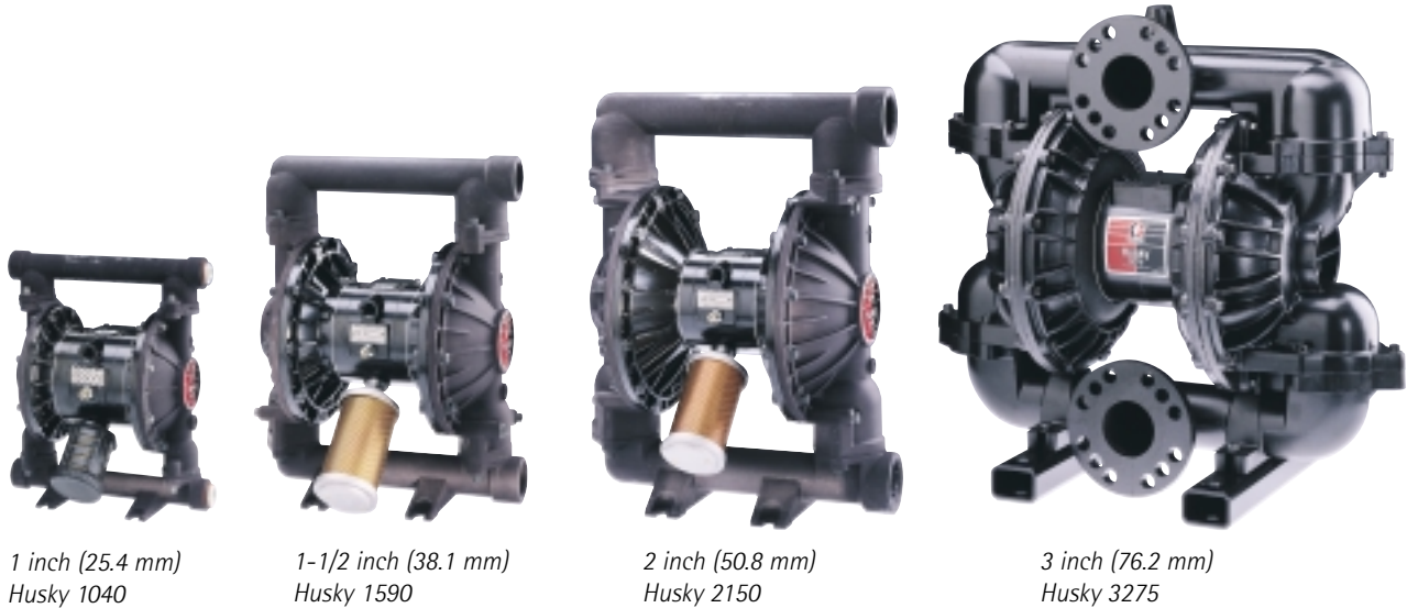
1 inch (25.4 mm) Husky 1040